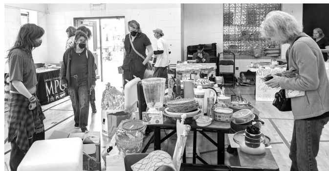
Yart Sale March. Thanks music for us to companionent.